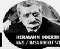
HERMANN OBERTH NAZI / NASA ROCKET SCIENTIST