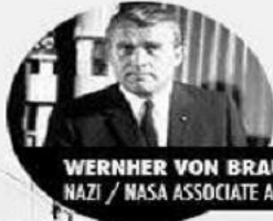
WERNHER VON BRAUN NAZI / NASA ASSOCIATE ADMIN.