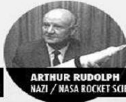
ARTHUR RUDOLPH NAZI / NASA ROCKET SCIENTIST